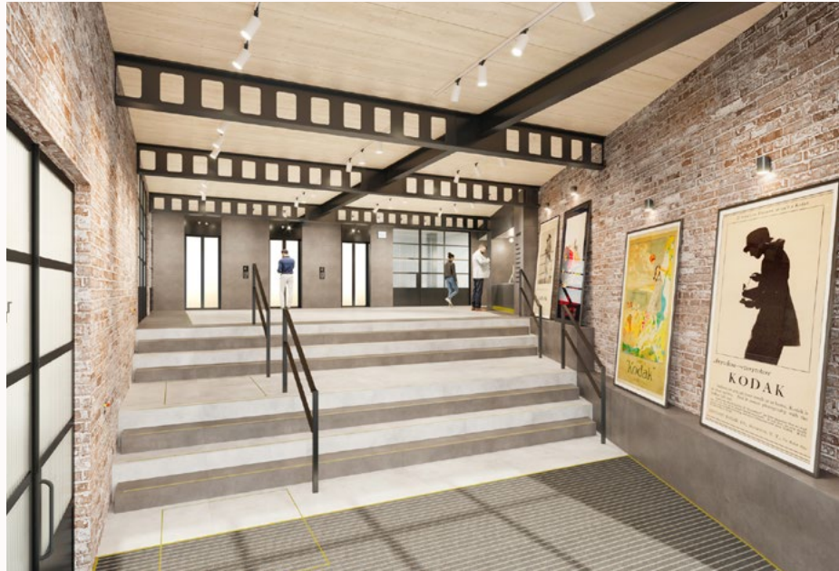
PROPOSED OFFICE ENTRANCE