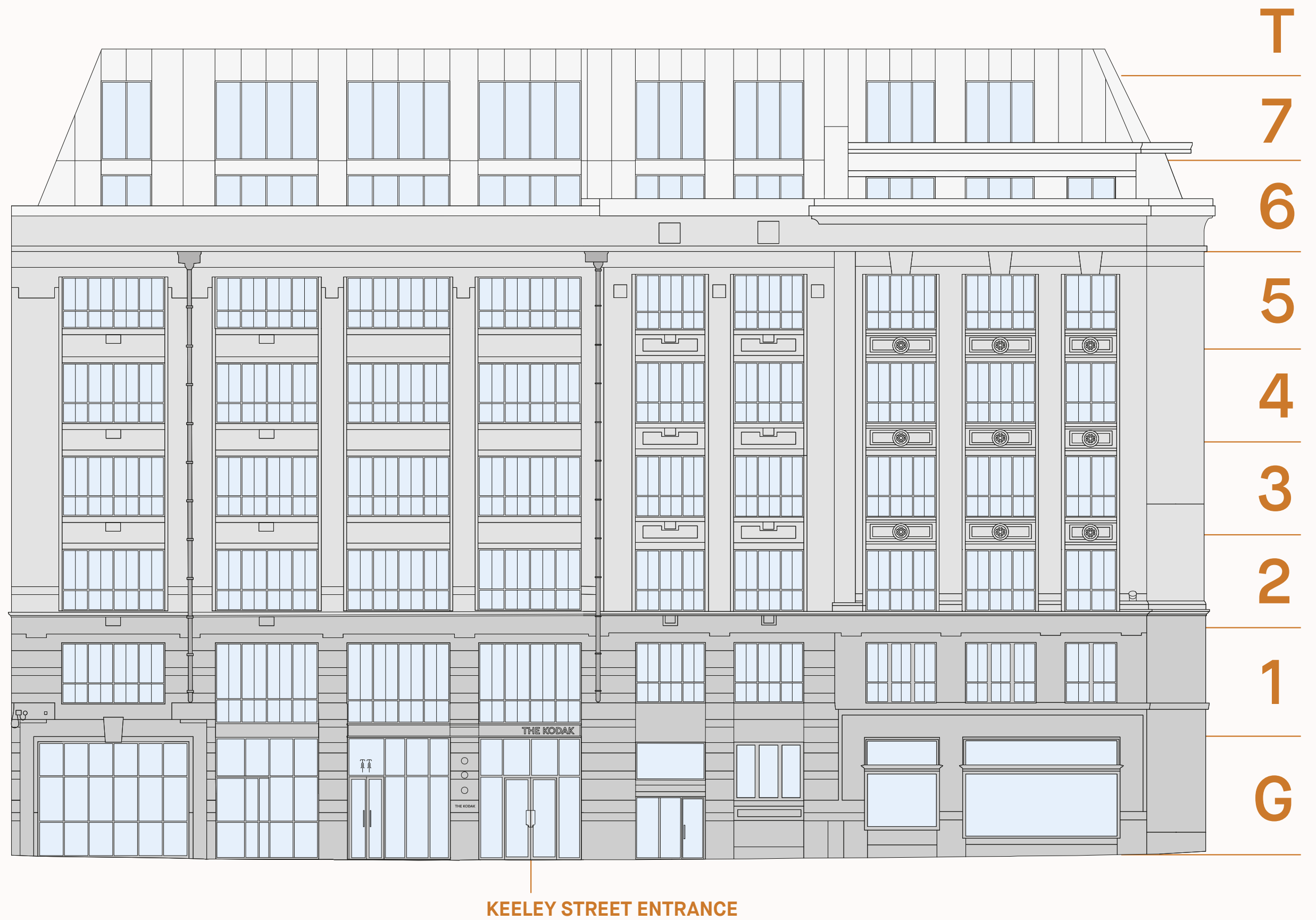
KEELEY STREET ENTRANCE